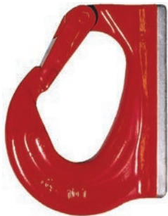
BH-313 WELD-ON HOOK